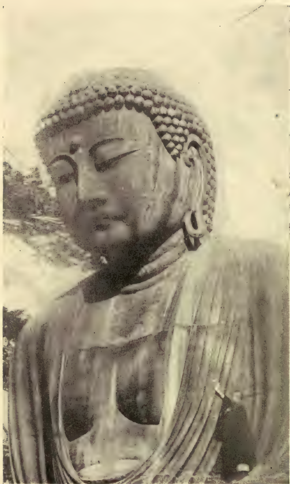
AMIDA BUDDHA AT KAMAKURA, JAPAN

Bronze, of the thirteenth century, 49 ft. 7 in. high